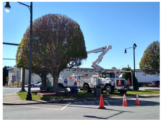
Above photo: Town employees putting up Christmas lights on October 25, 2021