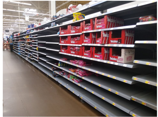
Above Photo: Walmart's candy aisle in Granite Falls on Tuesday, October 21, 2021

Part of the problem was the lack of workers. Employers posted “help wanted” signs, held job fairs, and announced wage increases and bonuses in attempts to lure applicants. Many people stayed out of the workforce for a variety of reasons, such as desiring to home school their children, needing to provide care for someone, waiting for the right job to come along, reaching retirement age, faring better under government assistance, and so forth. In addition, some people lost jobs because they were not vaccinated.